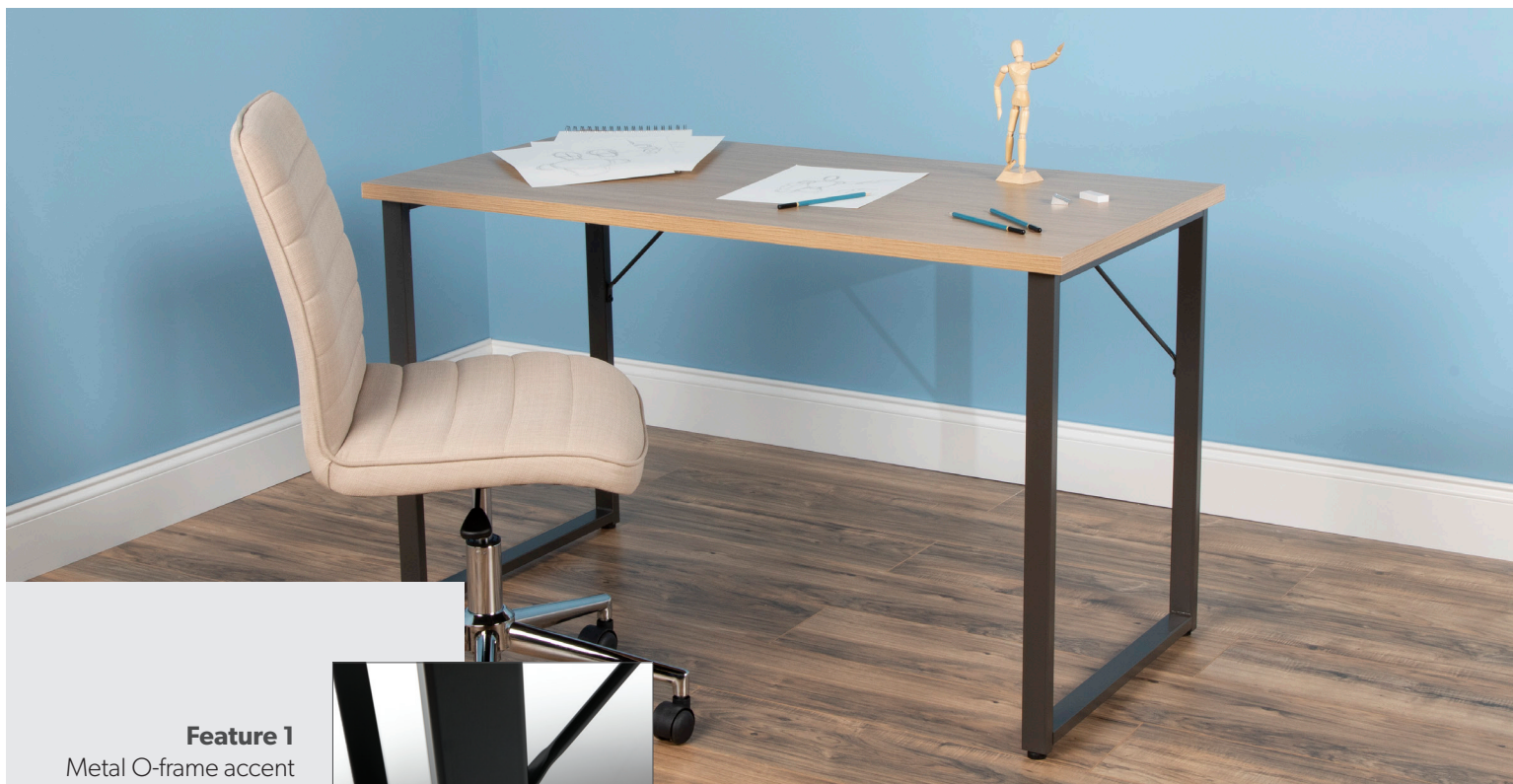
Shown in Harvest