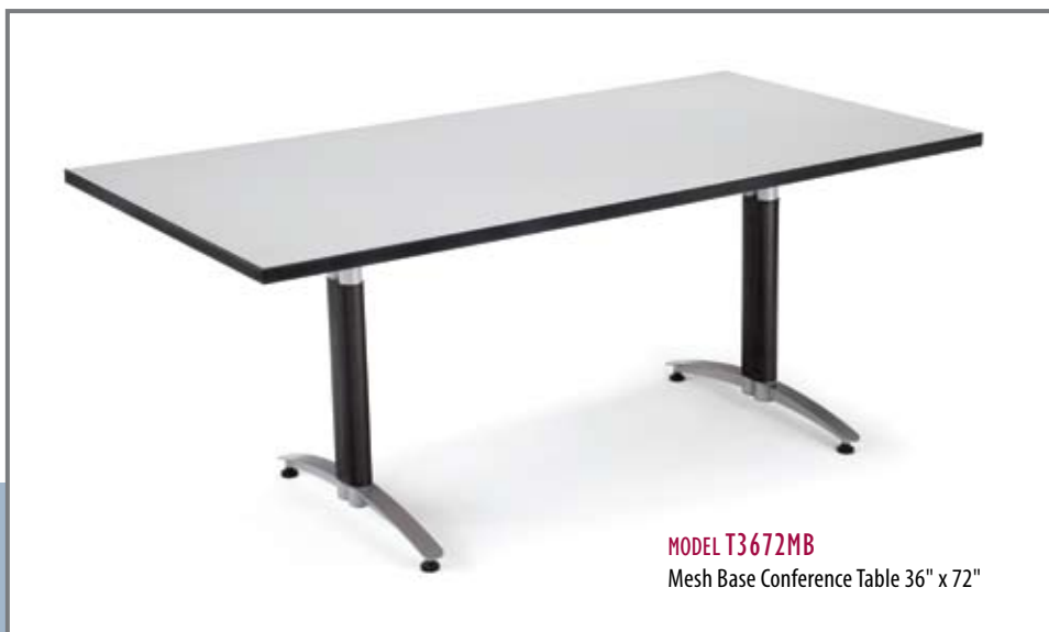
MODEL T3672MB Mesh Base Conference Table 36" x 72"