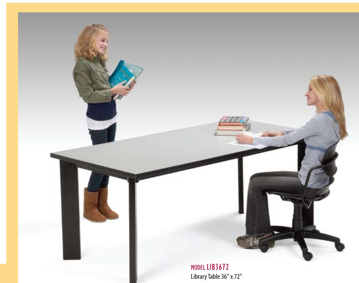
MODEL LIB3672 Library Table 36" x 72"

Model LIB4896 Overall Dimensions: 96" W x 48" D x 29" H