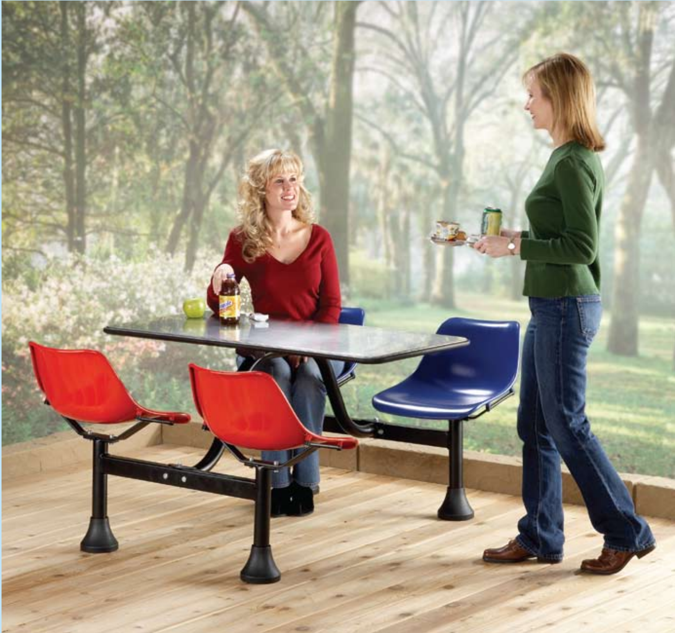
FOR INDOOR OR OUTDOOR USE.

Waterproof and Fireproof Group Cluster Table and Chairs. Easy to Clean Sanitary Stainless Steel Top. Scratch Resistant Powder Coated Paint Finish.